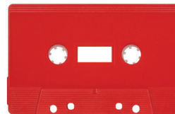
Red Solid MB-0822

Recom'd Inks: White, Black, Silver, Gold