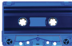
Blue Tint MB-2222

(SONIC) Recom'd Inks: White, Black, Purples, Reds, Silver, Gold