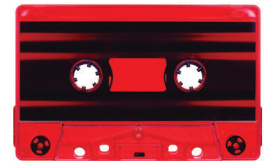
Red Tint MB-2622