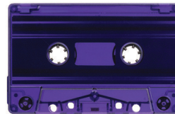
Purple Tint MB-3022