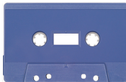
Purple Solid MB-2422

Recom'd Inks: White, Black, Brown, Reds, Silver, Gold