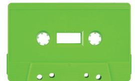
Lime Green MB-2822

Recom'd Inks: White, Black, Silver, Gold