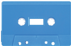
Light Blue MB-2722

Recom'd Inks: White, Black, Blues, Greens, Silver, Gold