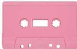
Light Pink MB-7622

(SONIC) Recom'd Inks: White, Black, Silver, Gold