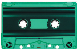
Green Tint MB-4422