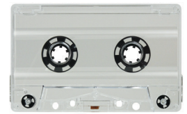
Clear w/Clear MB-0322CL