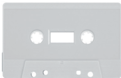
Gray Solid MB-8722