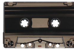
Smoky Tint MB-5422