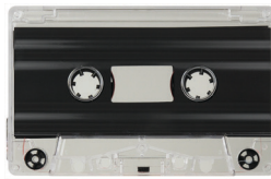
Clear w/ Black MB-0322